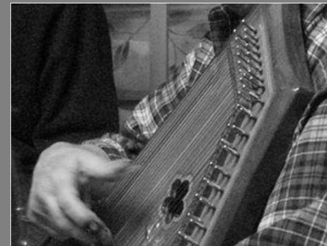
Strumming & Singing